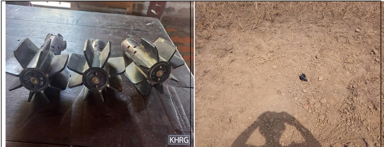
These photos were taken on February 3 rd 2023 in D--- village, Hper Htee village tract, Htaw Ta Htoo Township, Taw Oo District. The left photo shows exploded mortar shells that villagers collected and put in their house. The right photo shows one of the mortar shells that fell into a rice field, nearby the village.