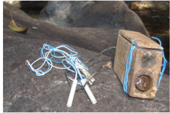
This landmine - made by hand from a block of wood, gun powder and battery-powered detonator – was deployed by DKBA soldiers from Special Battalion #999 in Dta Greh Township. It was subsequently retrieved and photographed by KHRG in January 2009.

In some cases, DKBA forces have planted landmines specifically to block civilian travel. This was the case following the relocation of villagers in Dta Greh Township to DKBA-controlled Htee Bper village in October 2008. At this time, residents of Htee Ber Kee village were attempting to flee the area to reach the Thai-Burma border via paths in the forest. DKBA soldiers therefore laid landmines along these forest paths forcing villagers to instead travel by roads which the soldiers could more easily monitor.