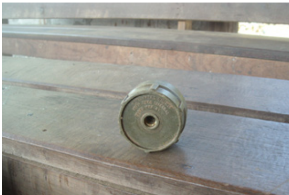
A Burmese copy of an American M-14 as photographed in January 2009. The M-14 is most commonly deployed by SPDC troops, but this particular mine was planted by DKBA soldiers active in Dta Greh Township.

“The mine in the photograph is... a bounding mine. This means when triggered, a small explosive charge blows the mine up from the ground where a much larger explosion takes place at chest height. They are lethal. The mine is an American made M26. Where it came from is a mystery to our experts as they state the mine is extremely rare. The mine which you document being lifted was brand new, and laid by someone who did not understand how it worked. Your photographs showed that it had been laid upside down. Our experts noted that one of your pictures showed that the arming pin [was] in place, so the mine was probably not armed. The internal trip wire spool in the base of the mine was still in storage position, and the tripwire lever was also in its storage position. Despite that, if armed correctly, the M26 is extremely dangerous and can also function on pressure.”