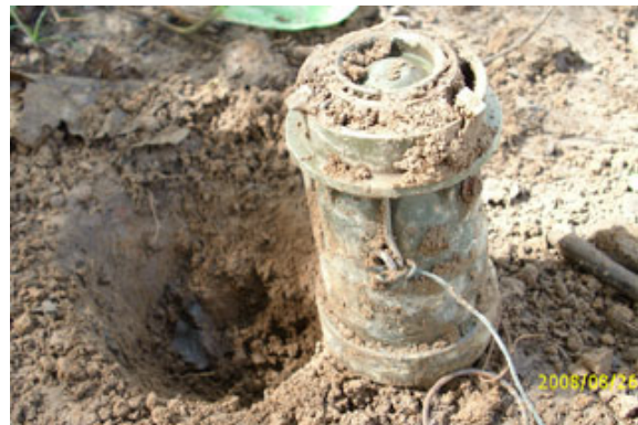
An American-made M-26 bounding mine photographed in August 2008. This mine was retrieved from around a recently abandoned SPDC Army camp in Dta Greh Township.

SPDC forces operating in Pa'an and Dooplaya districts have mostly deployed landmines around army camps and bases and alongside vehicle roads and bridges. In mountainous northern Karen State, SPDC forces have frequently deployed landmines in abandoned villages after residents have either fled or been forcibly relocated. While not a common practice, SPDC forces have in some cases informed local communities about the deployment of landmines in a given area – typically when laid around more permanent army bases.