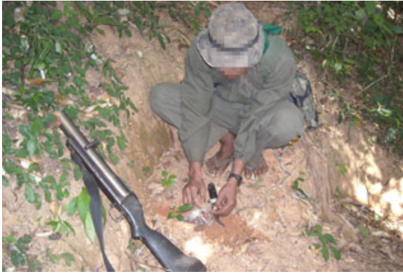
A KNLA soldier removes a DKBA-deployed landmine in December 2008 from a road in Dta Greh Township – a road which local villagers frequently use.