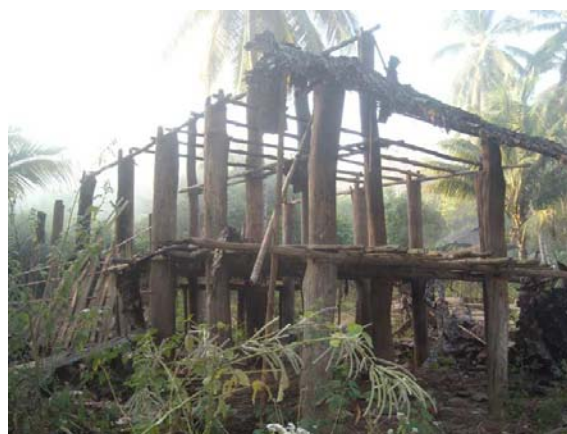
This photo – taken on December 31 st 2008 – shows the remains of a house at Htee Bper Kee village, Dta Greh Township, which DKBA forces destroyed on October 8 th 2008 after issuing forced relocation orders to local residents.

In some cases, these attacks have been employed as part of a forced relocation program in which soldiers have burnt down villages (typically located on the slopes of Dawna mountain range) in order to prevent the return of villagers relocated into DKBA-controlled areas. Such relocation reduces the possibility of contact between villagers and KNU/KNLA personnel and provides increased resources (new recruits as well as villagers' labour, money, food and supplies) for local DKBA forces.