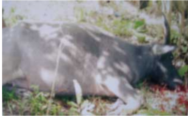
This photo, taken on November 27 th 2008, shows a water buffalo belonging to a villager in Dta Greh Township. The buffalo stepped on a DKBA-deployed landmine and subsequently died.

In another incident at the beginning of October 2008, 47-year-old Saw Pah Gkah, 45-year-old Saw Pah Leh, 18-year-old Saw Pah Htuh and 60-year-old and Saw Gkyaw Nweh – all residents of DKBA-controlled Htee Bper village – led their buffalos out to pasture on a nearby hillside for three or four days. While the buffalo were out grazing on the hillside, DKBA soldiers from Special Battalion #999 arrived and deployed landmines nearby. When the villagers learned that mines had been laid in the area, they decided it was too dangerous to travel up the hillside to retrieve their buffalo. By October 13 th 2008, six buffalo had been injured after detonating six separate landmines. When the first landmine was triggered, the explosion frightened the rest of the buffalo which then ran off and stepped on other mines in the area.