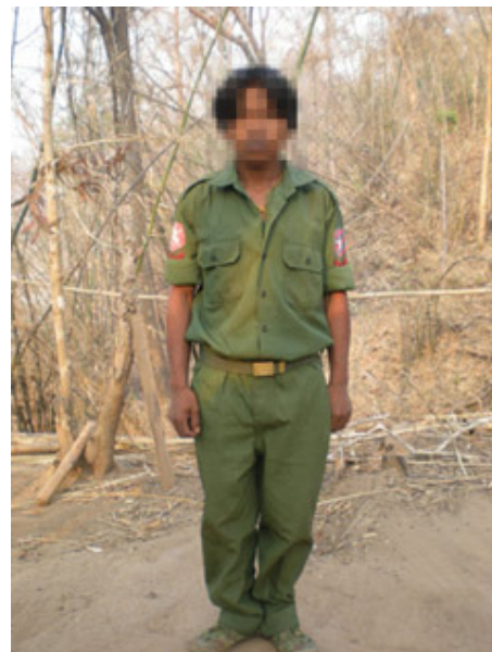
23-year-old Ko M---, an SPDC deserter shown here in April 2008. Following repeated abuse at the hands of a senior officer Ko M--- shot the officer dead and then escaped into an area controlled by the Karen armed opposition.

I have been a soldier for six years. Initially, they sent me to Military Camp #93. It took three or four days [to reach the camp] and then they sent me on to Ma'Oo Bin; the camp of IB [Infantry Battalion] 10 #27. I stayed there for three months. Up until that time I hadn't had a chance to attend any training. They [then] sent me to the Pathein Training Centre and then they called me back again to Ma'Oo Bin and I stayed one day. Then they sent me to Rangoon Recruitment Centre #1. This was located at Yangon D'Nyin Gon. I stayed there for four or five months. Then I had to go to T'Taung Training Centre #9. They sent 200 people [to the training centre]. I was there only one or two days and then they started the