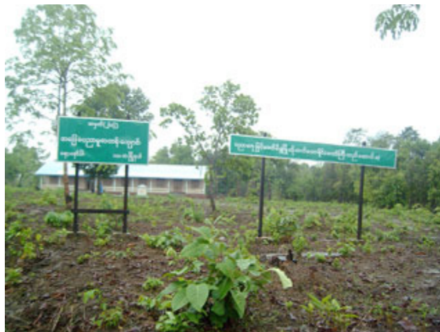
Noh Naw Wah primary school which villagers report they built with support from the UNDP. However, following the construction the SPDC claimed that it was instead the military regime which had financed the school.

Although the SPDC has provided some support for the construction of a limited number of schools in Thaton District, most have instead been built with village funds and village labour. In at least one case, at Noh Naw Wah village in Pa'an township, villagers reported that they constructed their school with partial support from the United Nations Development Programme (UNDP). While the villagers were aware of the UNDP backing for the school, local SPDC authorities announced following its completion that it had actually been funded by the regime.