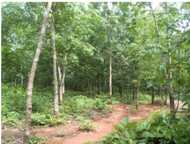
This rubber plantation at D--- village, Pa’an township, eastern Thaton District belongs to Bee Koh of DKBA Battalion #2, Brigade #333. Bee Koh has ordered villagers to clear the plantation’s undergrowth annually.

- Daw T--- (female, 55), village head, K--- village (June 2007)