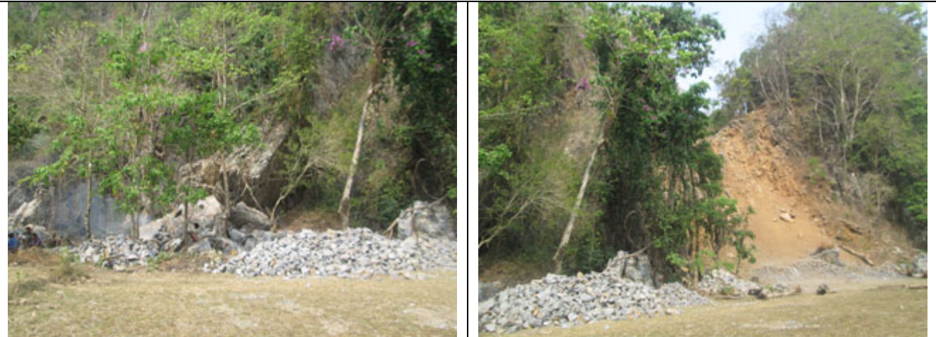
These photos were taken by a KHRG researcher on April 6<sup>th</sup> 2013 in M--- village, Paw village tract, Paingkyon Township, Hpa-an District. They depict the cliff erosion next to Naw T----'s farm plot due to stone mining conducted by BGF Officer Lah Thay.

For example, in H--- village, Taw Soh village tract, Paingkyon Township, two BGF officers confiscated approximately 20 acres of land from two villagers. Although, both Naw I--- and Naw J--- held official land grants provided by the Burma/Myanmar government, BGF Battalion #1020 officers Boh Kyaw Hay and Boh Kya Aye told them, "Your land grant is illegal, so we will take your lands." The officers demanded the women pay a total of 1,100,000 kyat (US $1,071.60) for the return of the land. The women negotiated with soldiers, but ultimately sold their personal belongings in order to pay for the return of their land. Naw I--- had to sell her gold and Naw J--- had to sell one of her motorbikes, after which their land was returned to them.<sup>17</sup>