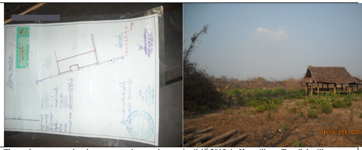
These photos were taken by a community member on April 1<sup>st</sup> 2013, in H--- village, Taw Soh village tract, Paingkyon Township. They show lands confiscated from villagers lands by the BGF, specifically BGF officers Boh Kyaw Hay and Boh Kya Aye.

and that they had not received compensation for land that had been appropriated prior to 2013. As a consequence, villagers experienced problems earning their livelihoods and KHRG has received several reports of villagers having to sell their possessions to buy back their confiscated land.