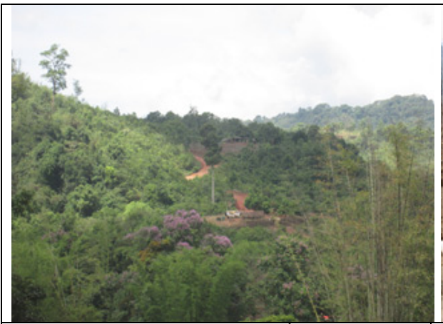
This photo was taken on May 12<sup>th</sup> 2014. It is the Tatmadaw military base near Muh Theh village, Kyaukkyi Township, Nyaunglebin District.