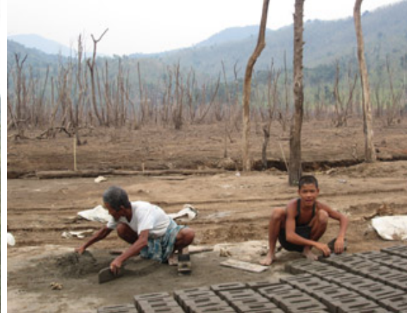
This photo shows a father and his son making cement blocks for their livelihoods. He [the father] sends his son to school [by making money from cement blocks].

Further background reading on the situation in Nyaunglebin District can be found in the following KHRG reports: