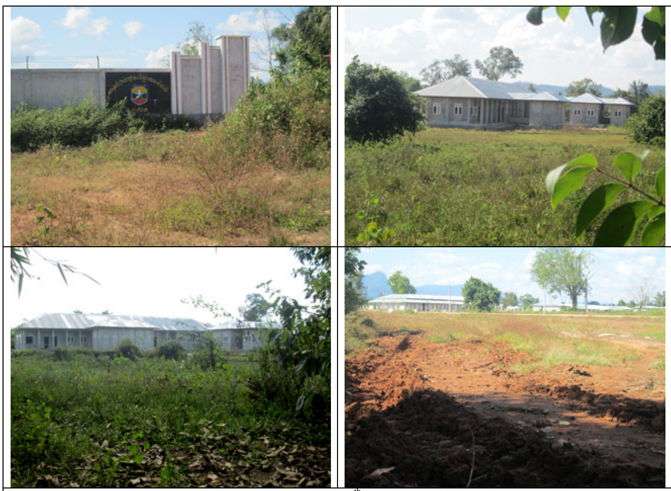
These photos were taken by an A--- villager on November 20<sup>th</sup> 2013 in B--- village, K'Ter Tee village tract, Dwe Lo Township, Hpapun District. The first photo shows the entrance gate of BGF Battalion #1013's army camp with its military symbol. The signboard reads, "No #1013 Border Guard Force, Ka Taing Ti". According to the KHRG community member who met with the A--- villager, the BGF confiscated 135 acres of villagers' land, including villagers' rubber plantations, cashew plantations and farms. There are 75 buildings in the BGF Battalion #1013's army camp and the workers have almost finished constructing the buildings on that land. The landowners could not do anything to protect their land from being confiscated for the camp, as they already mistakenly signed documents and accepted compensation from the BGF and company for their land.