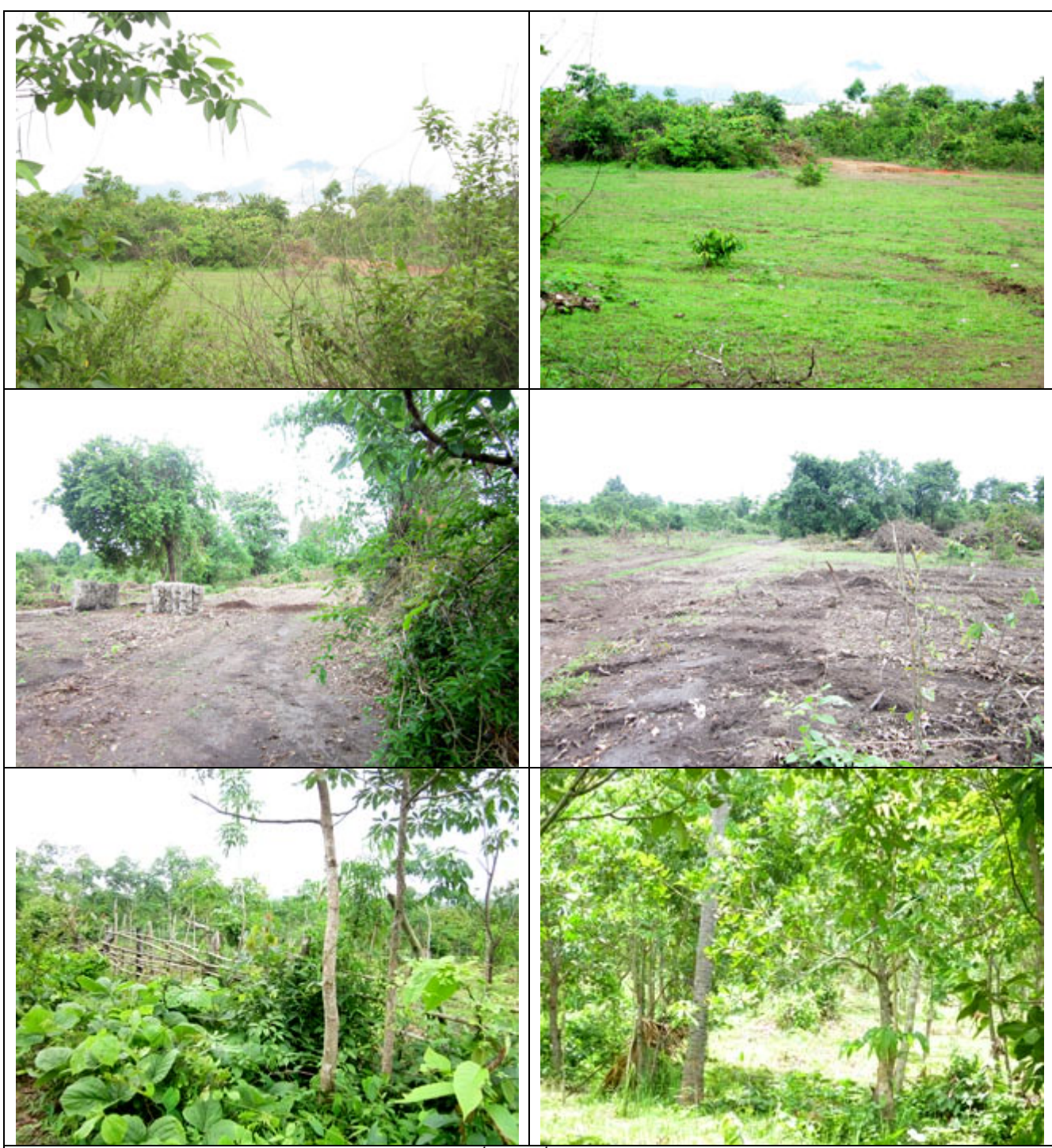
These photos were taken by an A--- villager on June 6<sup>th</sup> and 7<sup>th</sup> 2012 in between K'Ter Tee and Baw Kyoh Leh villages, which are in K'Ter Tee and Noh Hpaw Htee village tracts. According to the villager, BGF Battalion #1013 will build their shelter and work place in this area, and it will damage villagers' rubber plantations, cashew plantations and farms. As can be seen in the bottom right photo, a plastic rope was hung in the villagers' plantation to designate the land for the military compound, reportedly placed there by a BGF soldier. On June 8<sup>th</sup> 2012, the BGF #1013 battalion commander ordered an A--- villager to meet with the battalion regarding the plantations and farms that were to be confiscated for the military base. According to the KHRG community member, the two BGF commanders in charge of this project are