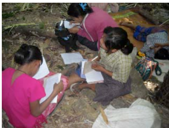
The attacks by MOC #10, which caused more than ten schools to be abandoned, coincided with exams for the students. Some communities were able to gather in hiding places, where students resumed their studies. This photo, taken on February 7 th 2010, shows students from Htee Baw Hta studying in one such hiding site. Htee Baw Hta was razed on February 9 th 2010.

sites and hidden food stores, five villagers have been shot and killed since January, including one man who returned to his home to retrieve food for his family and a mother and her two children. Battalions from MOC #10 documented in northern Kyauk Kyi Township include Light Infantry Battalion (LIB) #361, #362, #363, #364, #365, #366, #367, #368, #369 and #370. 5 Well to the south, in Shwegyin Township past the road linking Shwegyin Town and the Koh Hshaw SPDC Army camp, LIB #350 from MOC #20 has also begun new operations in the area around Htee Blah, Htee Wah Kee and Doo Pah Leh villages. Soldiers from LIB #350 operating in this area are commanded by Than Sein Ko. This confirms an early report by the Free Burma Rangers (FBR), which estimated that the operation by LIB #350 displaced 200 people. 6