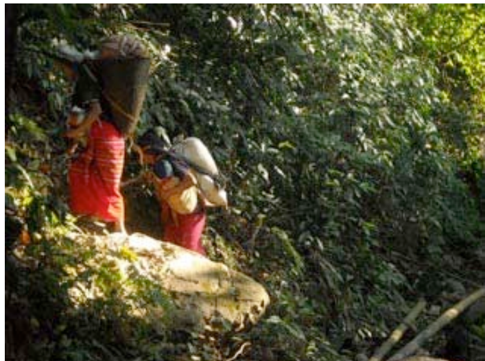
At least 2,000 villagers have been displaced by SPDC Army attacks on villages in Kyauk Kyi Township, Nyaunglebin District. In this photo, villagers climb in upland Kyauk Kyi as they seek safety from attack.

At least 2,000 people have been displaced since State Peace and Development Council (SPDC) Army battalions from Military Operations Command (MOC) 1 #10 began operating in northern Kyauk Kyi Township, Nyaunglebin District during January 2010. 2 The SPDC has been attempting to consolidate control of this area since beginning an offensive in northern Karen areas in early 2006. This offensive has involved the forced relocation of thousands of villagers to government-controlled lowland areas. 3 Thousands more villagers who seek to evade relocation 4 continue to be subjected to targeted attacks in which they may be shot on sight by SPDC forces and their farms, villages and food stores destroyed.