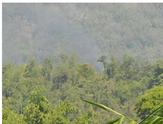
On the same day, smoke could be seen rising from nearby villages. This photo, also taken on February 7 th 2010, was taken after SPDC troops from MOC #10 set fire to Hee Toe Hta and Ka Dee Mu Der villages.

KHRG first documented the displacement of 1,000 villagers in Kyauk Kyi Township on January 17 th 2010, when LIB #367 established a camp near Keh Der village tract, between the Theh Loh and Mu Loh rivers. At the time, LIB #367 shot and killed Saw My---, 40, from Keh Der, as well as Saw E---, from Tu Ghaw village. 7 Then, on February 5 th 2010, near the edge of Kyauk Kyi Township and to the south of Keh Der, SPDC soldiers entered the Kwee Lah village tract area, displacing another group of villagers. Parts of Kwee Lah are close to the Roh Ka So SPDC camp, and until February villagers had been able to evade SPDC Army control while living just a few hours away from an established army camp. As a result of these attacks, KHRG researchers now estimate 2,000 villagers from Kyauk Kyi are newly displaced, in hiding and actively seeking to avoid being shot by the SPDC Army.