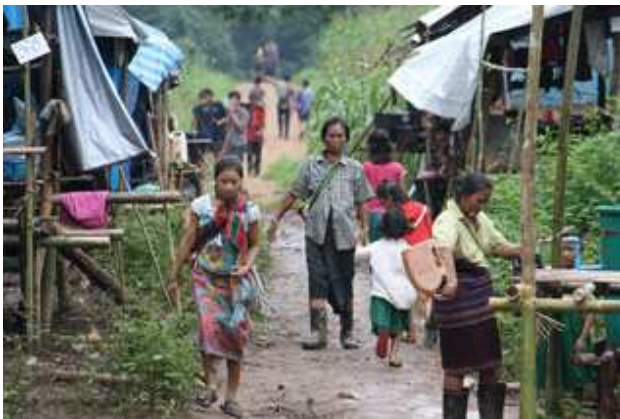
This photo, taken on August 5 th 2009, shows refugees at the Oo Thu Hta new arrival site. The woman at right is filling water buckets, which she must carry across the site to her family's sleeping area.

Her area on the Burma side of the Moei River adjacent to Mae Salit, up through Thay Bay Htar, Lay Wah, Mu Ay Bpoo and Meh T'waw to Gklaw T'Tee. DKBA soldiers are also occupying areas recently taken from the KNLA, as well as conducting regular patrols in "front line" contested areas. On August 21 st 2009, DKBA soldiers from Brigade #999 and 555 divided control of the newly taken areas along the Moei River. Sandwiched between LIBs #203 and 28 are Battalions #4, 5 and 7 from DKBA Brigade #999, which are currently operating in the immediate vicinity of the recently vacated KNLA camps. This area includes villages north of the Ler Per Her IDP site until Mu Aay Bpoo, Battalions #1 and 2 from Brigade #555, meanwhile, are operating in relatively the same area as LIB #203.