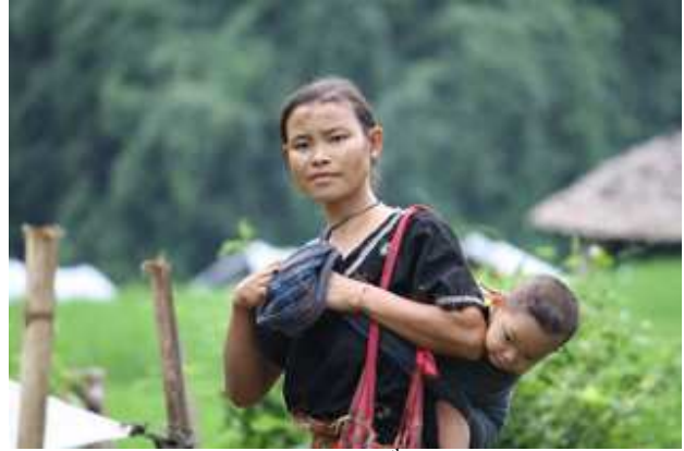
This photo, taken on August 5 th 2009, shows a young woman with her son as she leaves one of the new arrival sites to retrieve rice left behind at her village near the Thai-Burma border. Though her village is located in Thailand, she fled to avoid DKBA soldiers who had crossed into the country from Karen State.

Though refugees at the temporary new arrival sites in Thailand do not wish to be moved to Mae La because they hope to return home, they say they are worried about their security and potential DKBA attacks at their current locations. The sites are only a two hour walk from the border, and will be even more easily accessible as the water level in the Moei River drops after the rainy season. Such an incursion would not be unusual; since January 2009, KHRG has received six reports of the DKBA or mortars fired by the DKBA or SPDC crossing into Thailand. These include incidents in which small arms fire was exchanged with soldiers of both the KNLA and Thai army. 9 Most recently, at 8:00 pm on August 30 th , soldiers from Battalion #4 of DKBA Brigade #999 fired one 60 mm shell on the Oo Thu Hta new arrival site. No one was injured and the mortar missed the camp, though it reached close to the Thai Karen village of Htee Nuh Hta. Refugees in Oo Thu Hta told KHRG that they spent the rest of the night worrying there would be more shells or a ground attack by the DKBA.