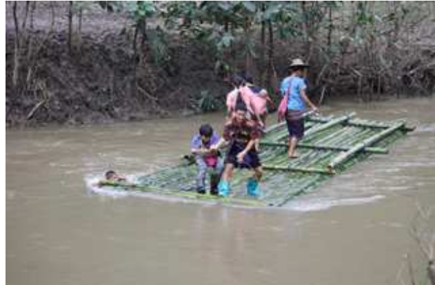
This photo, taken on August 5 th 2009, shows men pulling a transport raft across the Moei River, which forms the Thai-Burma border near their new arrival site in Tha Song Yang District. When the water level drops following the rainy season, their site will become more vulnerable to DKBA attack.