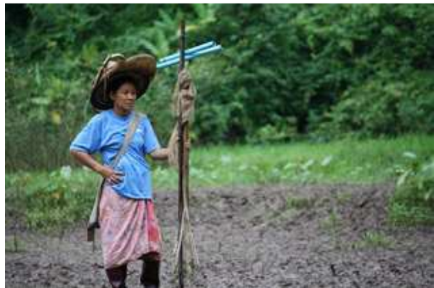
This photo, taken on August 5 th 2009, shows a woman as she carries a fishing pole to a river near her new arrival site. Though the refugees are receiving food support, some families attempt to augment their rations.