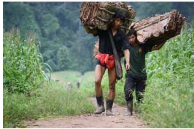
This photo, taken on August 5 th 2009, shows men from the Oo Thu Hta new arrival site as they carry roof thatching from the Thai Karen village of Htee Nu Hta. August saw a momentary pause in the normally heavy monsoon rains, but the thatching is still vital for their local clinic.

Although SPDC and DKBA forces now control the former KNLA positions around Ler Per Her, KNLA soldiers continue to make brief hit-and-run attacks and place landmines near DKBA/SPDC camps. According to KHRG researchers, DKBA soldiers on patrol are bearing the brunt of the attacks. SPDC and DKBA forces both also continue to plant landmines near their camps as well as in abandoned villages. KHRG researchers have been closely monitoring new arrivals to the sites in Tha Song Yang, and report that villagers say they are fleeing because of ongoing SPDC and DKBA demands for forced labour and military recruitment. KHRG researchers operating in Pa'an District, meanwhile, report that villagers remaining in their villages regularly face exploitative abuse by the SPDC and DKBA.