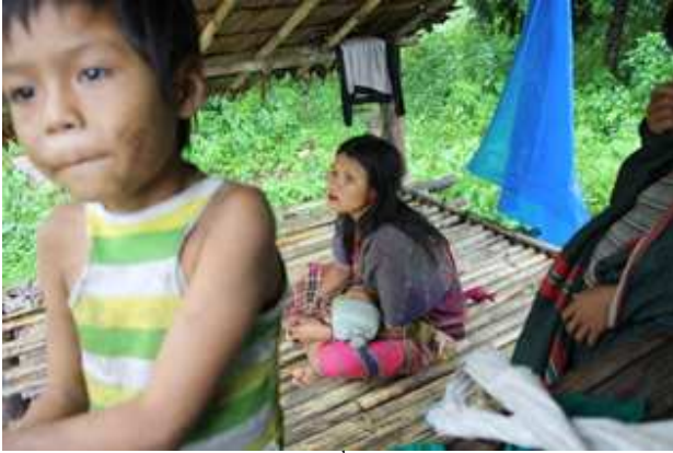
This photo, taken on July 3 rd 2009, shows a family from Pa'an that fled to a village just across the border in Thailand. Though they have continued to work on a farm located inside Karen State, they have been unable to access it since June 2009 due to fears of abuse by SPDC and DKBA soldiers now active in the area.