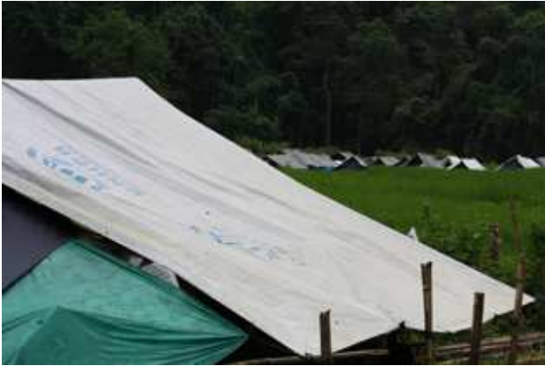
This photo, taken on August 5 th 2009, shows temporary shelters at the Oo Thu Hta new arrival site, currently home to 1,988 people. The roofing tarps are stamped with the logo of the United Nations High Commissioner for Refugees.

villagers to return home, promising that he could protect villagers from SPDC abuse. 8 In July, however, some villagers said that friends who remained inside Pa'an District had called to warn them that they should not return, because Company Commander Bper Gkay of DKBA Battalion #7 of Brigade #999 had ordered his soldiers to arrest any returning villagers and assume they were in cooperation with the KNLA.